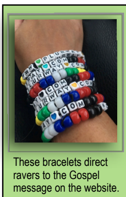
These bracelets direct ravers to the Gospel message on the website.