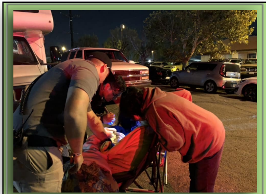
We called the medical team to assist ravers who got sick from drugs.