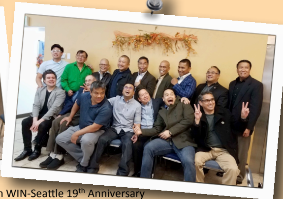
Some Men and Women from WIN-Seattle 19 th Anniversary celebration, Oct. 28, 2018 "Marked by Love"