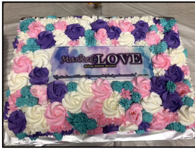
"Marked by Love", 19 th Anniversary Cake WIN-Seattle