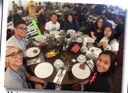
Make rice available ...hahaha