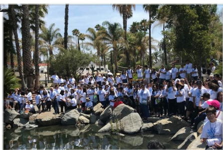
Let’s do it again in two years time!