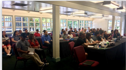
Ministers and Spouse Session

“There could’ve been more time allotted to a more workshop-atmosphere and reflections as well as mingling with other members of the WIN family.”