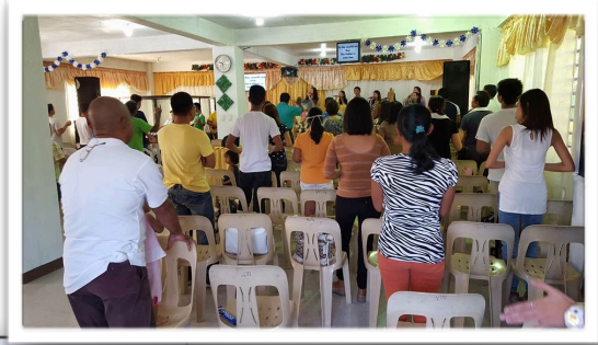
WIN Baliwag Sunday Service