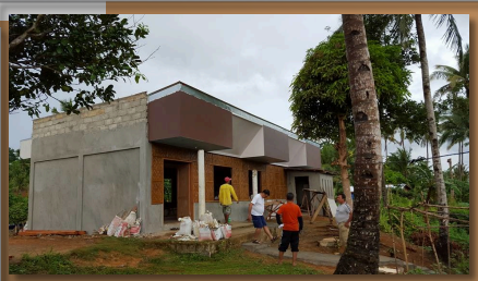
WIN Sta. Rosa church 80% complete