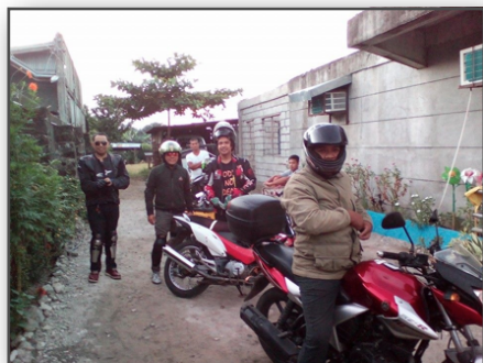
Pastors on motorcycles to Aurora

Spearheaded by the Joshua Mission Team Batch 6 of WIN Quezon City and WIN Medical-Dental Mission Team, along with the Gospel Riders (group of motorcycle riders from different churches), conducted a Dental Mission, Relief-Giving and Evangelism to the survivors of typhoon Lando in Depaculao, Aurora last November