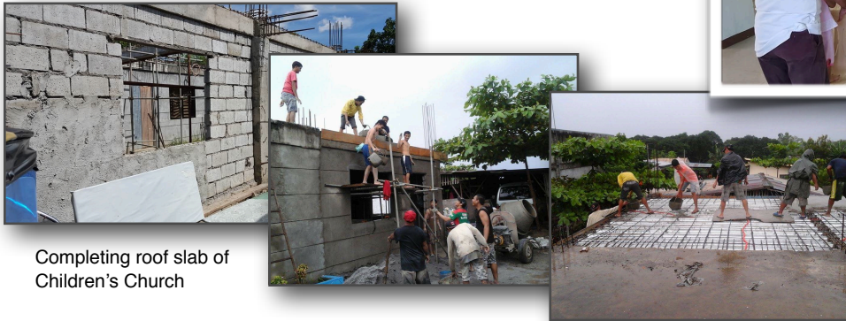
Completing roof slab of Children's Church