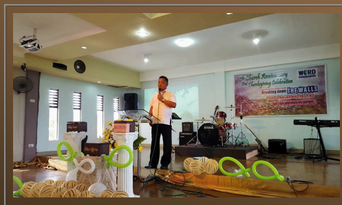
WIN Palompon church completed