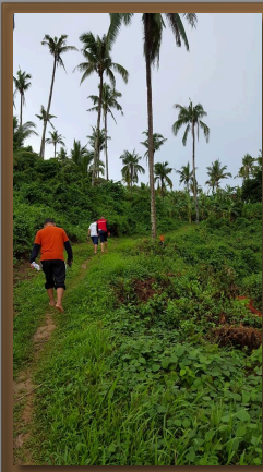
Up the hill to WIN Sta. Rosa