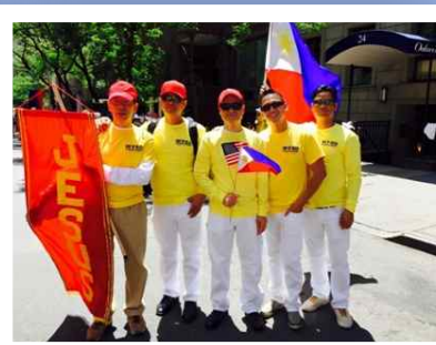
WIN New York join the Philippine Independence Day celebrations.