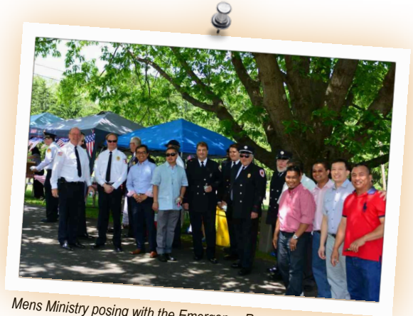
Mens Ministry posing with the Emergency Response personnel

“We welcome all the Memorial Day parade participants. We gather today to honor and remember those who died while serving in the country's armed forces. Like all of us, they had dreams and desires which they gave up in order to serve this country. We enjoy today the fruit of their service and it is but fitting to remember through events such as this the sacrifice they have sown in the past.”