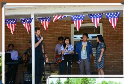
One of the volunteers sang with our youth