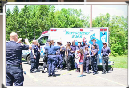
Selfies at WCFI