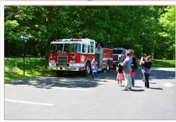
Kids enjoying the trucks

So thank you very much for bearing with us as we did the best we can to make your stay here worthwhile. We salute the families of those who have lost loved ones in the service of the country. Again, we are Word Christian Fellowship and we hope to extend the blessing of fellowship with all of you and you are all welcome to visit us."