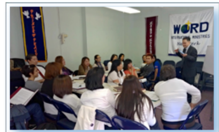
WIN New York

WIN Southern California continues to provide WISL, having the most courses given to their students. Courses for credit have been offered.