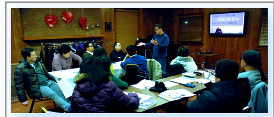
WIN New Jersey