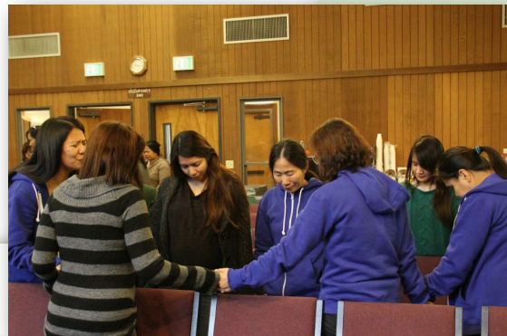
WIN-LA Ladies come together every week for prayer

Ladies, let's come together to make a difference in another